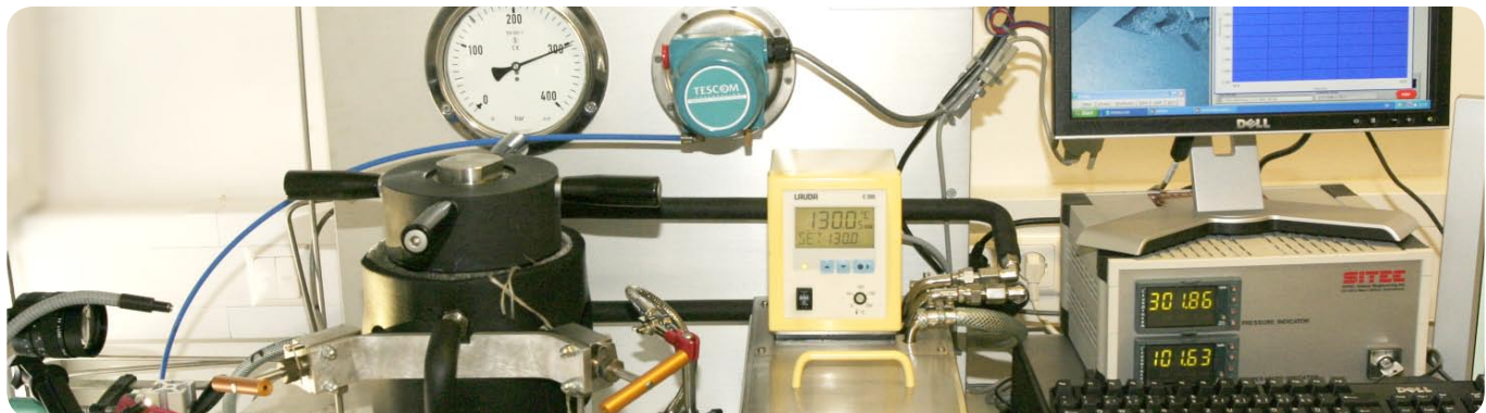
Testing equipment, R & D

Evaluation of the tests has been performed as visual inspection with a rating according to the respective standards. The respective rating systems can be found in Annex 1 to this document.