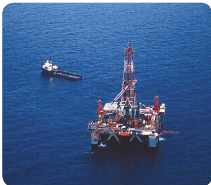
Oil and Gas industry

Some test results of the following materials are reported in this document. These tests were carried out at MPC Economics GmbH in accordance with well known test standards for ED tests for elastomeric materials for the Oil and Gas industry.